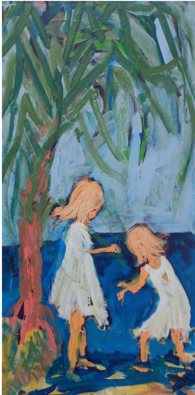
Splash - Mixed Media on Board, Image H120 x W 60cm - Framed Size H 132cm x W 72cm - $3,600 inc gst