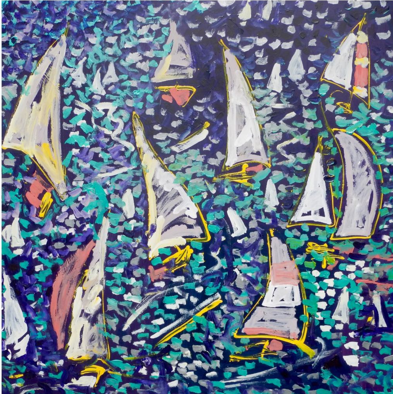
Noosa Regatta - Mixed Media on Board - Image 120 x 120cm (Framed 135 x 135cm) - $7200 inc gst