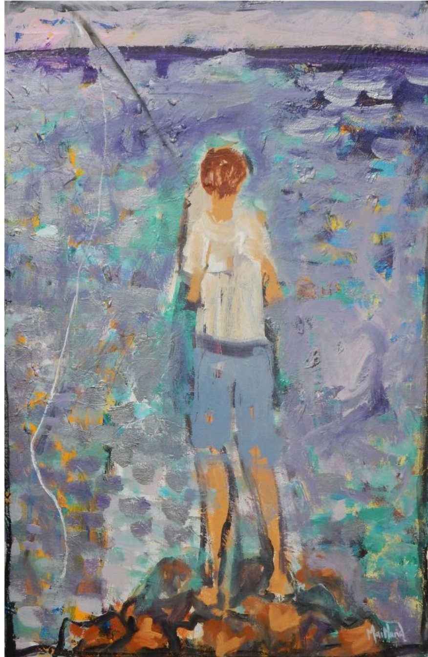
Jetty Fishing, Mixed Media on Canvas - 90 x 60cm - $2,700 inc gst