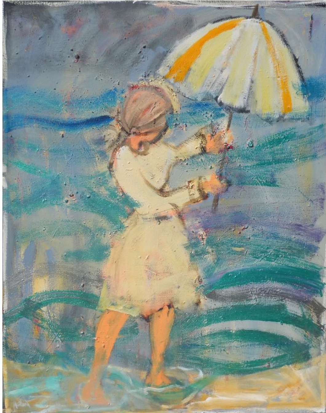
Yellow Parasole, Mixed Media on Canvas H 150cm x W 120cm - $9,200 inc gst