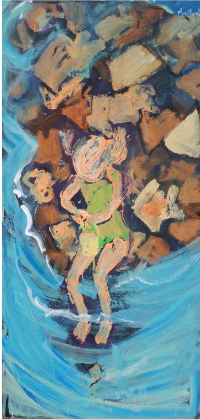
Yellow Bucket - Mixed Media on Board, Image H120 x W 60cm - Framed Size H 132cm x W 72cm - $3,600 inc gst