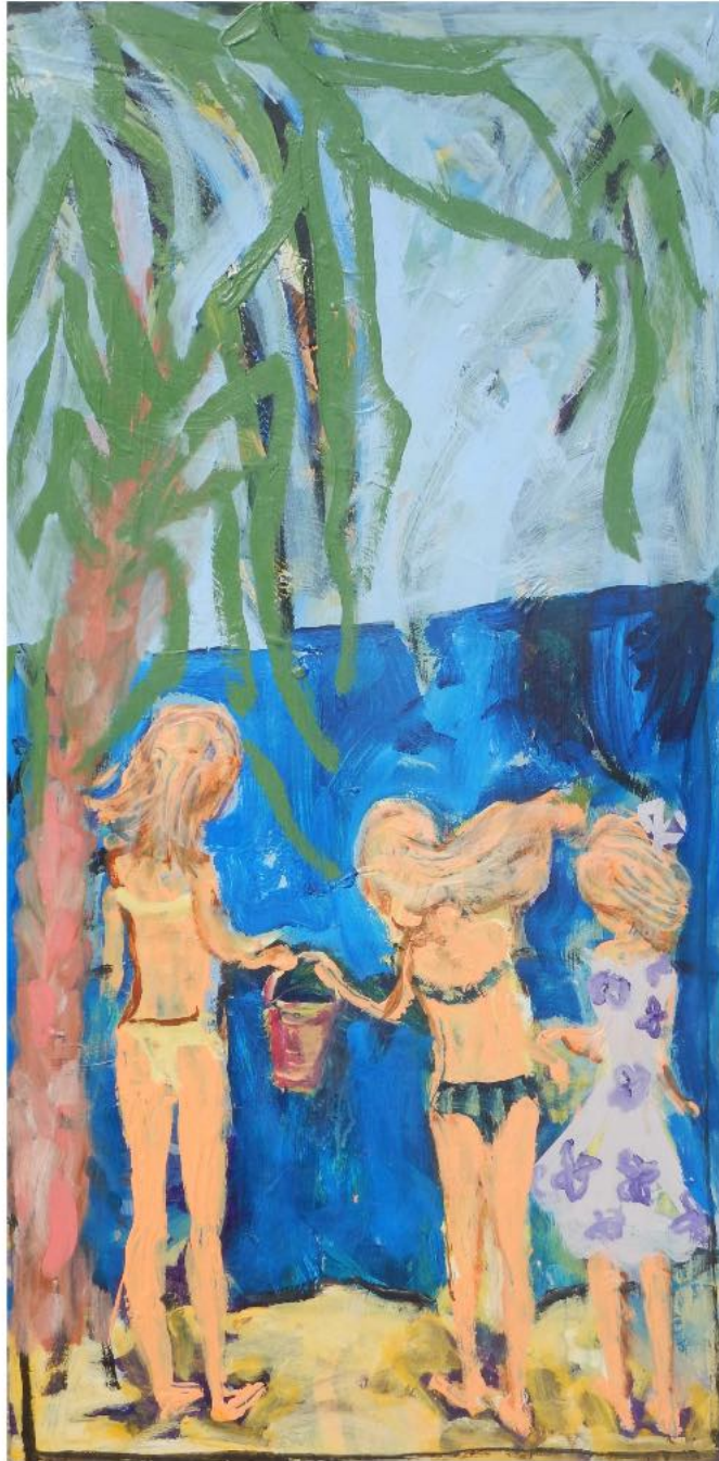
Starfish - Mixed Media on Board, Image H120 x W 60cm - Framed Size H 132cm x W 72cm - $3,600 inc gst