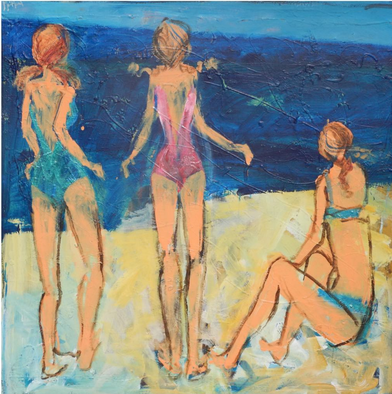
Bathers II (2) - Mixed Media on Canvas - H 120cm x W 120cm - $7,200 inc gst