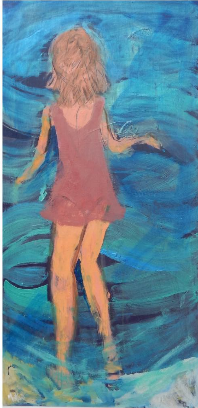
Paddling - Mixed Media on Board, Image H120 x W 60cm - Framed Size H 132cm x W 72cm - $3,600 inc gst