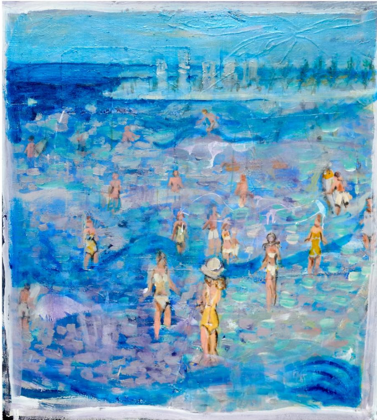
A Sea of People - Mixed Media on Canvas - H 115cm x W 105cm - $5,900 inc gst