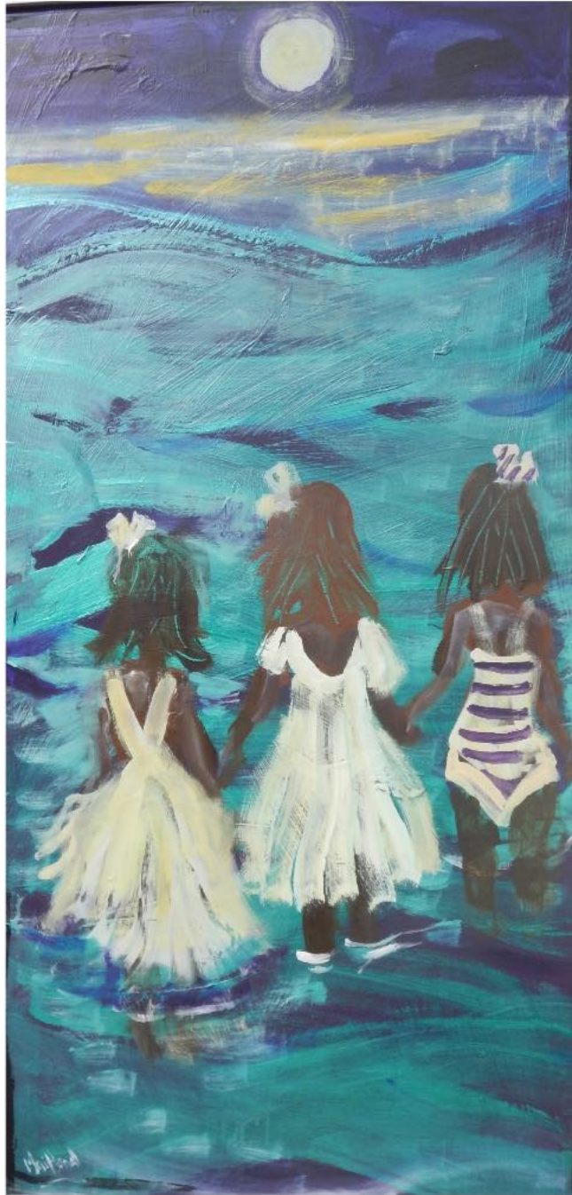
Moondance I Mixed Media on Board, Image H120 x W 60cm - Framed Size H 132cm x W 72cm - $3,600 inc gst