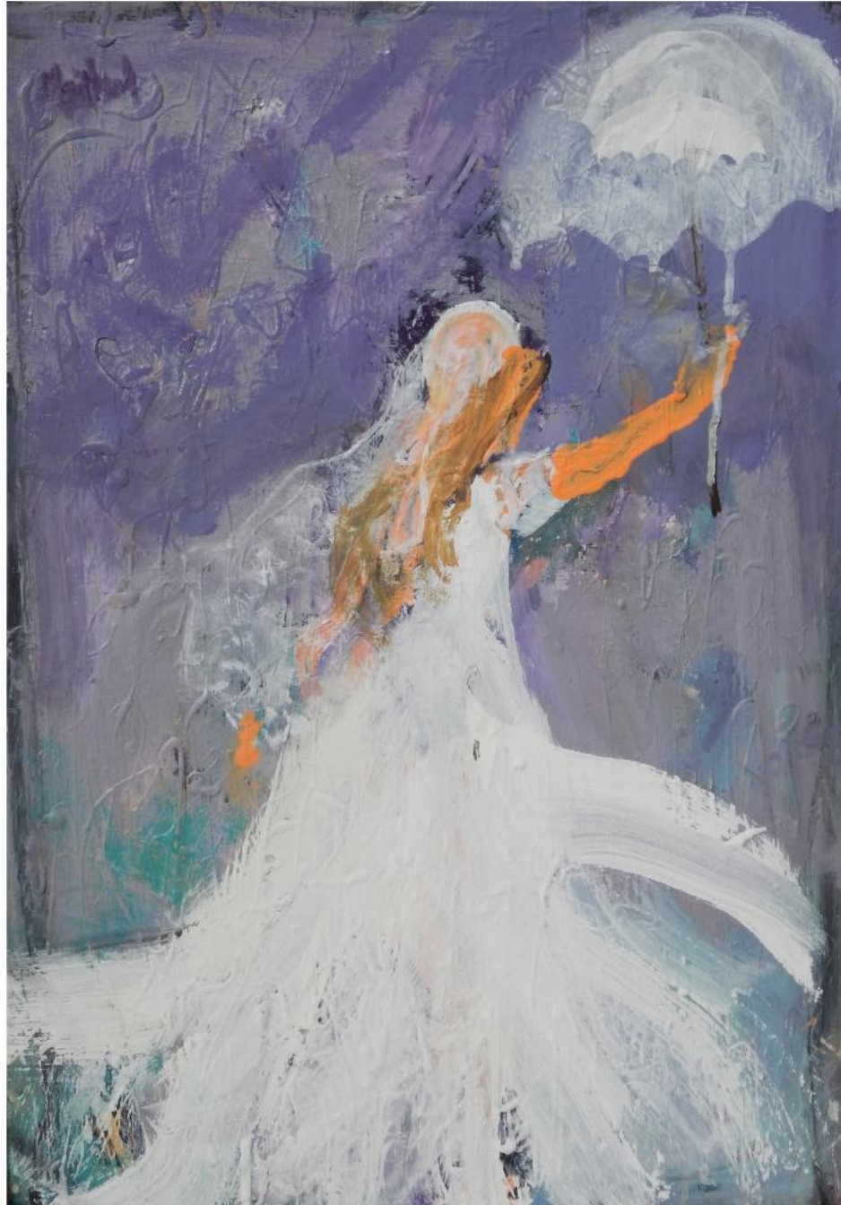
Beach Wedding with White Parasole, H 56cm x W 37cm (Framed H64cm x 45cm) - $1100 inc gst