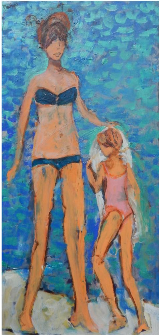
Bathers VIII (8) Mixed Media on Board, Image H120 x W 60cm - Framed Size H 132cm x W 72cm - $3,600 inc gst