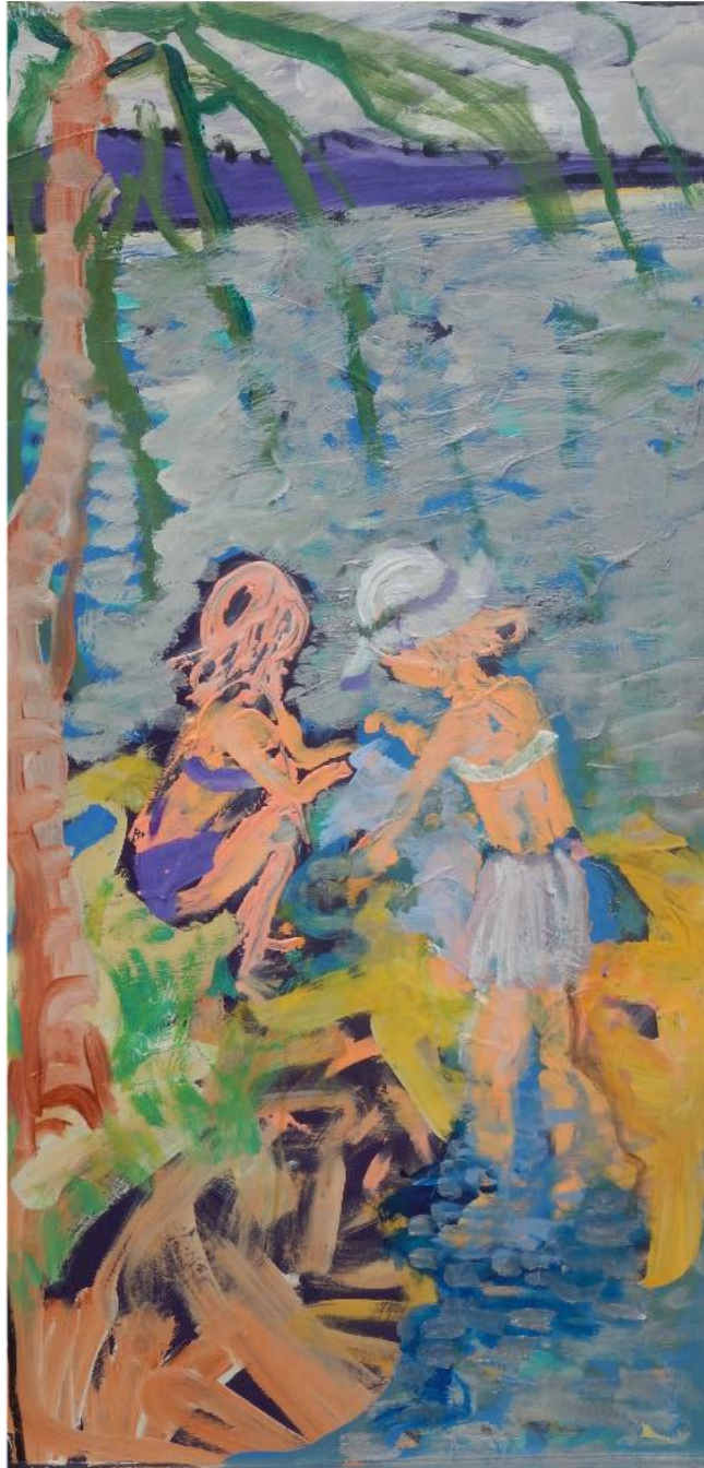
Rock Pools - Mixed Media on Board, Image H120 x W 60cm - Framed Size H 132cm x W 72cm - $3,600 inc gst