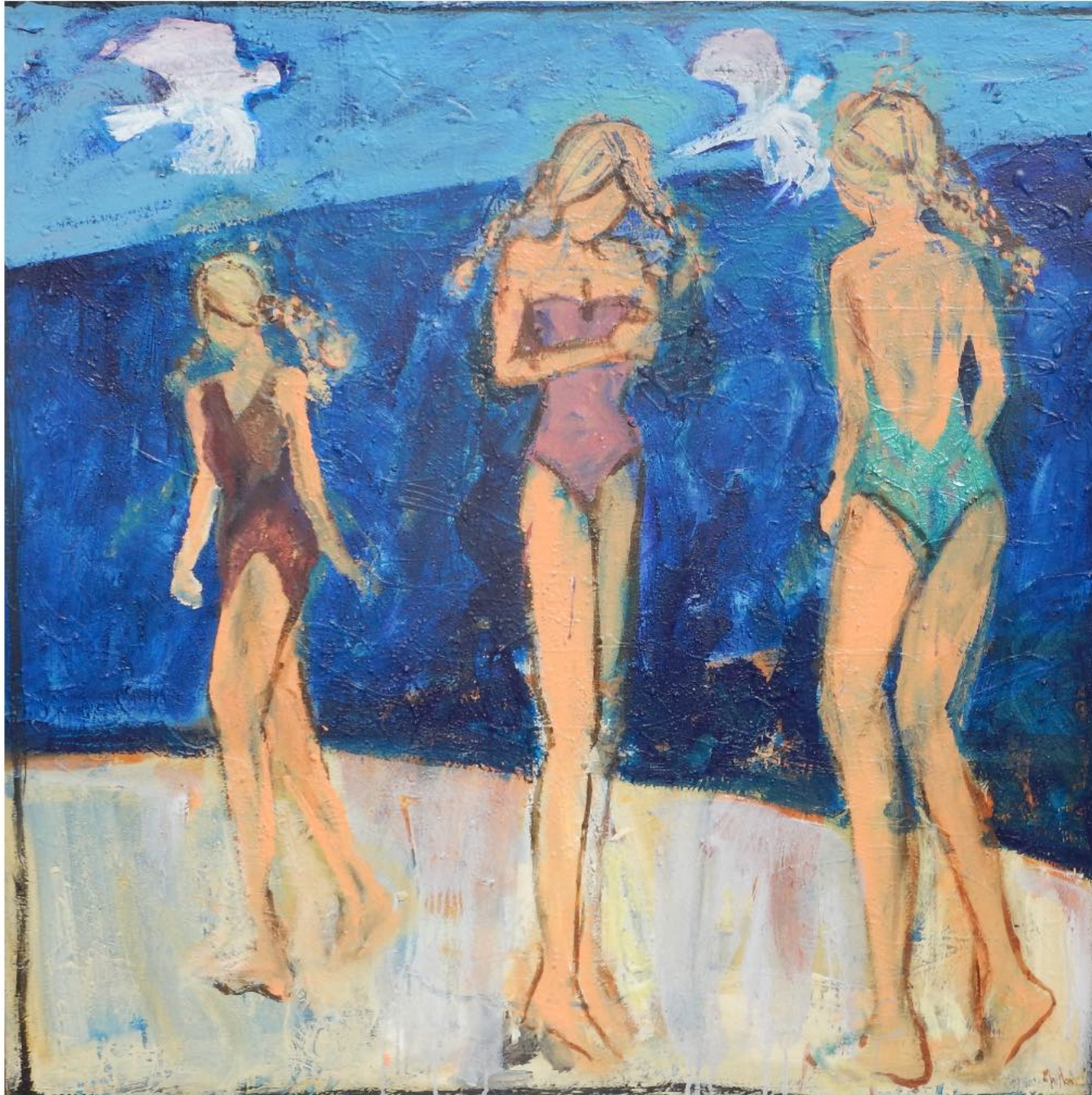
Bathers III (3) - Mixed Media on Canvas - H 120cm x W 120cm - $7,200 inc gst