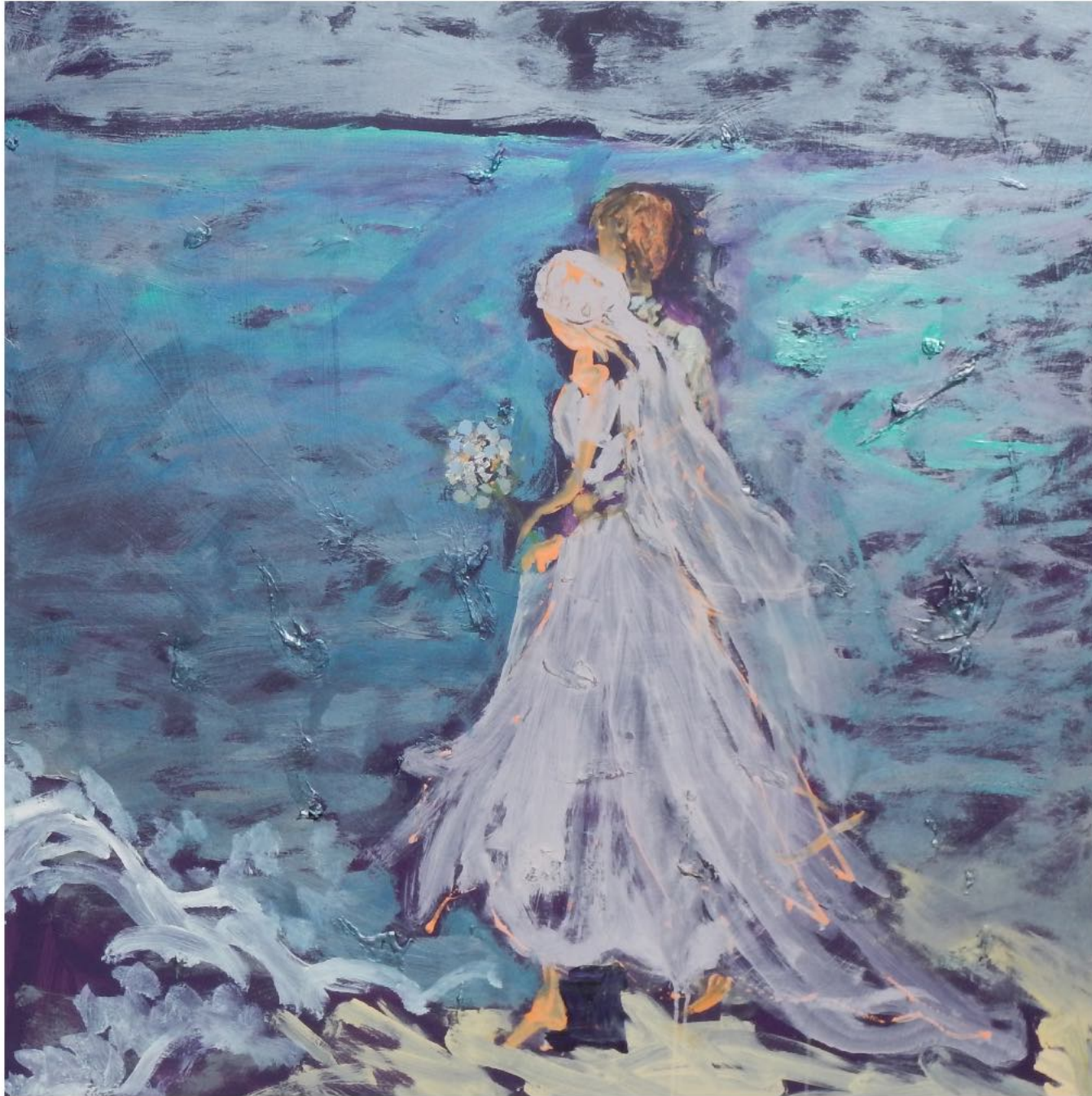
Beach Wedding I - Mixed Media on Board - Image 120 x 120cm (Framed 135 x 135cm) - $7200 inc gst