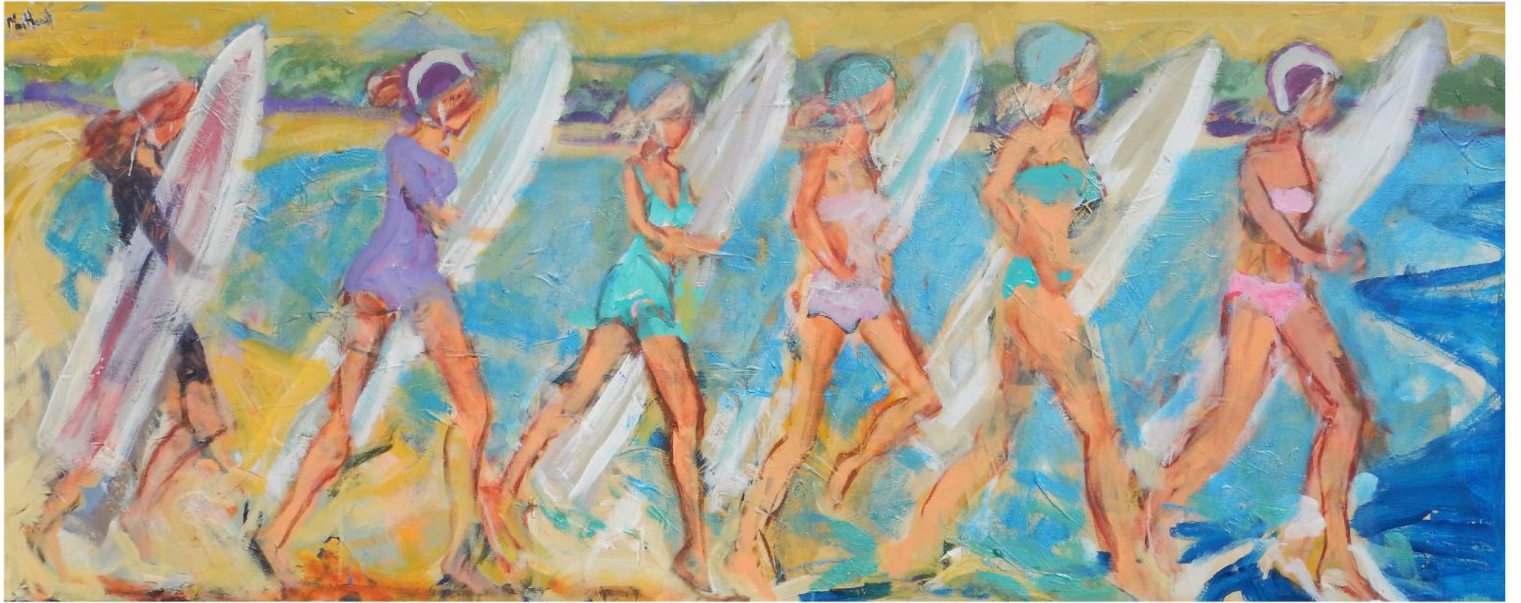
Surf Comp - Acrylic on Stretched Canvas - H 72cm x W 180cm - $6,500 inc gst