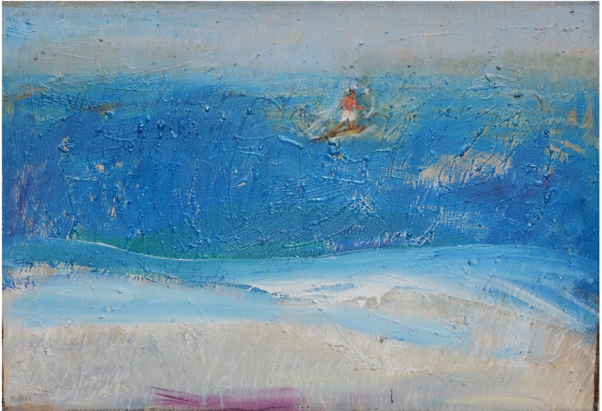
Salt Water - Mixed Media on Linen - 90cm x 130cm - $5,900 inc gst