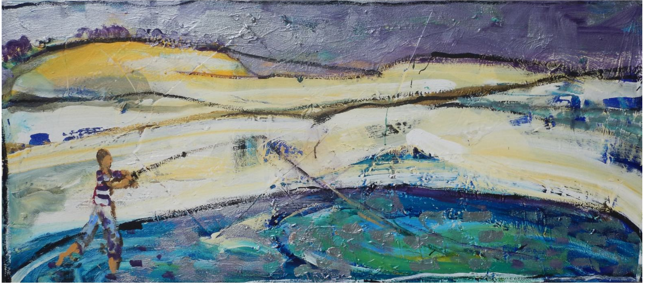
Fishing at Opal Cove II - Mixed Media on Canvas - H 60cm x w 137cm - $4,100 inc gst