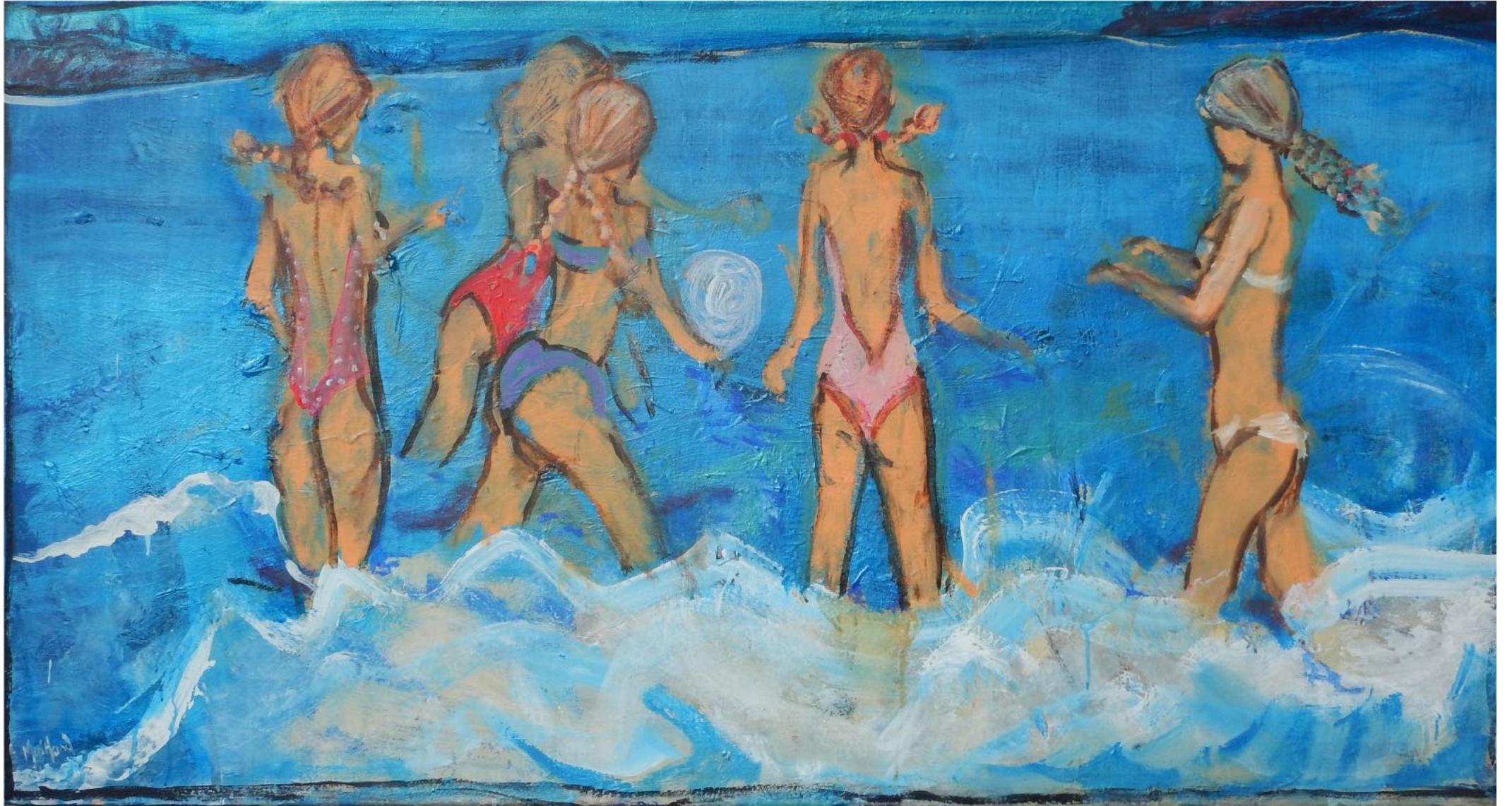
Bathers VI (6) - Mixed Media on Canvas - 140cm x 75cm - $5,100 inc gst