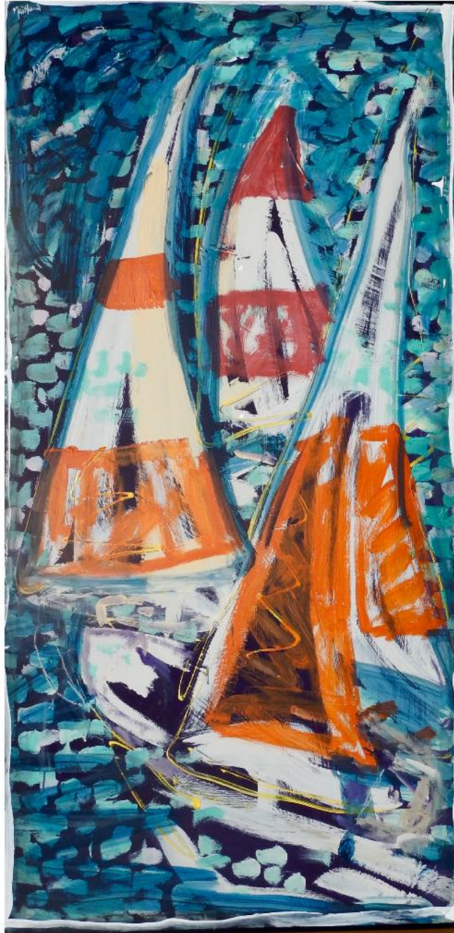
Off Mooloolaba - Mixed Media on Board - Image 189cm x 94cm (Framed H 203cm x W 112cm) - $8,500 inc gst